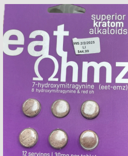
Unapproved drug products such as tianeptine and kratom extracts