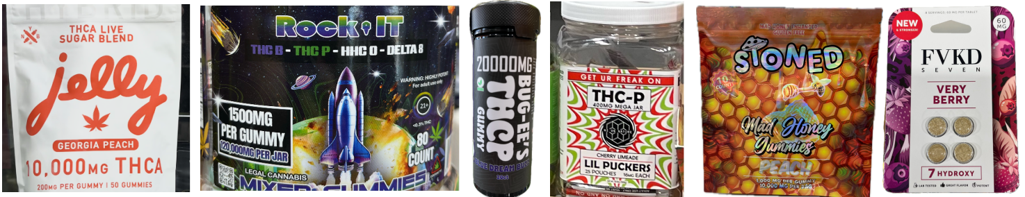
Examples of Products in Texas Stores

Without these measures, Texas will remain a hotspot for the sale of high-potency, illegal substances disguised as “legal products.”