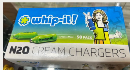
Deceptively labeled inhalants like nitrous oxide and nitrite poppers