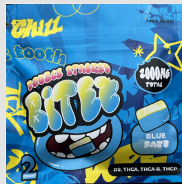
THC edibles imported into Texas, which federal law prohibits