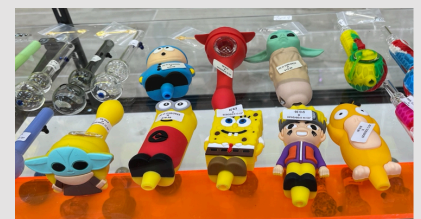
Items in kid-friendly packaging that appeals to youth