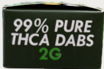
THC edibles and vapes far exceeding legal potency limits