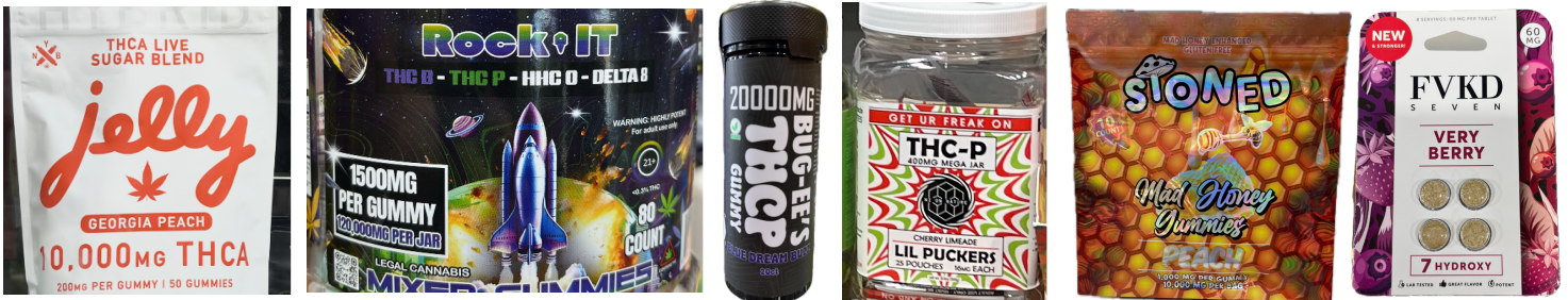
Examples of Products in Texas Stores

Without these measures, Texas will remain a hotspot for the sale of high-potency, illegal substances disguised as “legal products.”